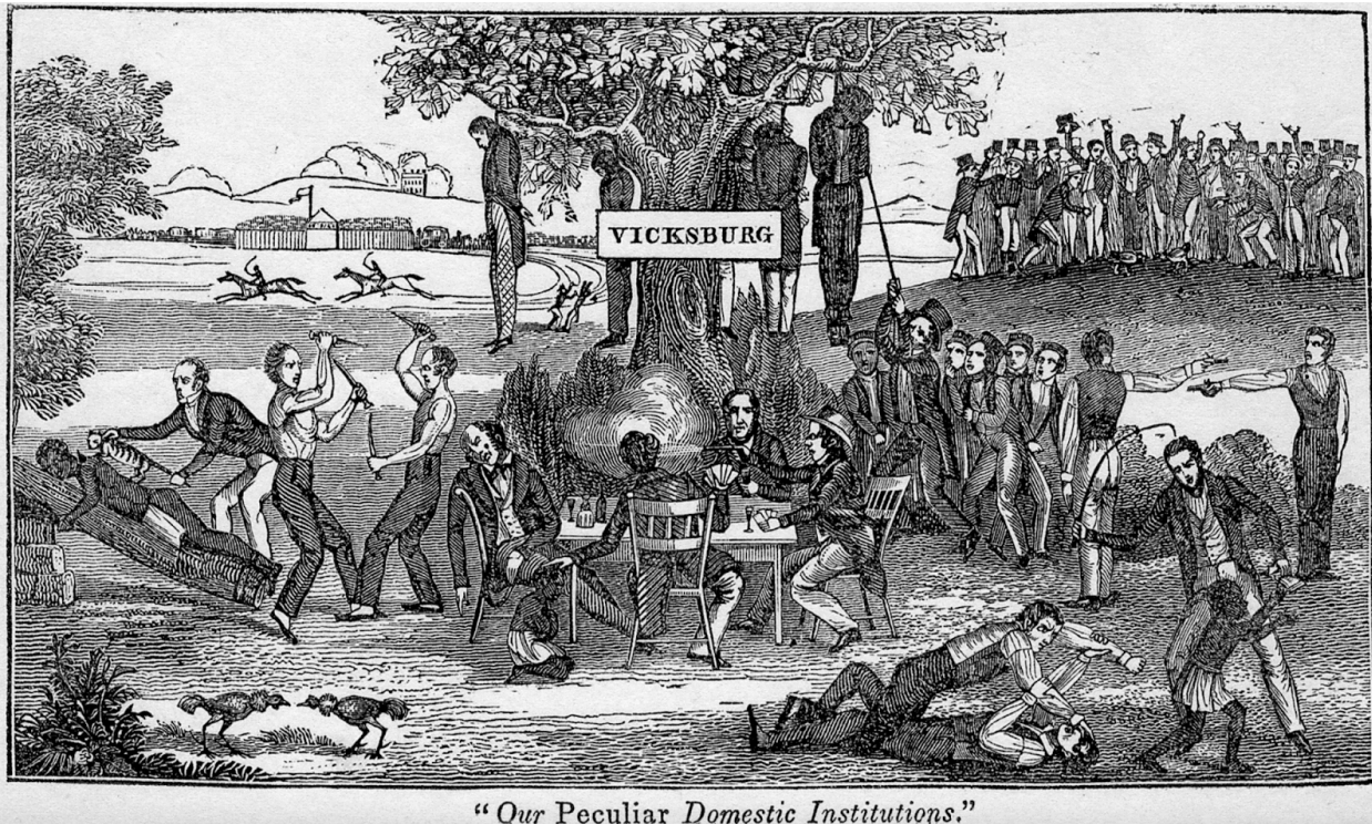
"Our Peculiar Domestic Institutions."

Image: "Our Peculiar Domestic Institutions"